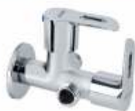
2way Angle Cock Code : 1,270