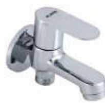
2Way Bib Cock Code : 1,130