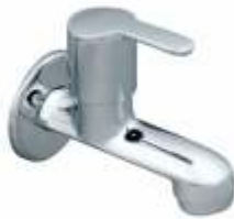
Bib Cock Long Code : 946