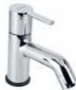
Pillar Cock Code : 1,645