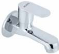
Bib Cock Code : 930