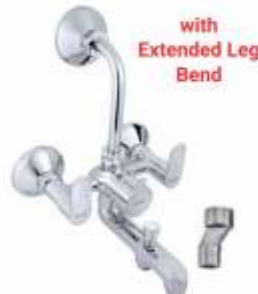
Wall Mixer 3 in 1 (ELB) Code : 6,540