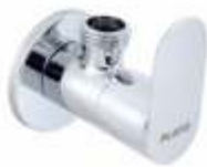
Angle Cock Code : 620