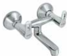
Wall Mixer NTS Code : 4,270