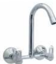
Sink Mixer High Flow Code : 2,885