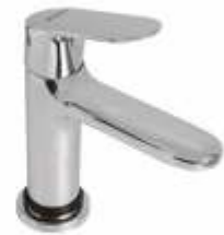
Pillar Cock Code : 2,945