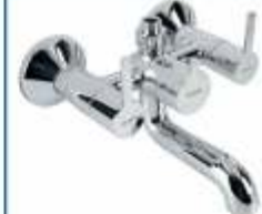
Wall Mixer Crutch Code : 5,665