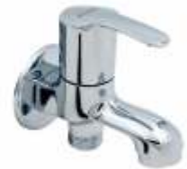
2 Way Bib Cock Code : 1,141