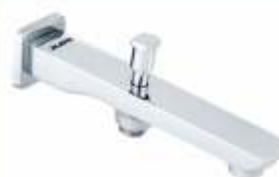
Bath Spout Tip Ton