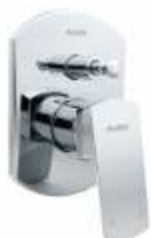
Diverter Upper Trim (46CHF28) Code : 1,420