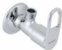
Angle Cock Code : 850