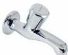
Bib Cock Long Code : 1,565