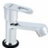
Pillar Cock Code : 1,045