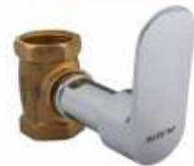
Concealed Stop Cock Size 15 mm Code 1,550