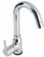
Swan Neck Code : 2,790