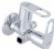
2way Angle Cock Code : 1,635