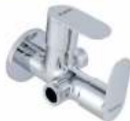
2Way Angle Cock Code : 1,255