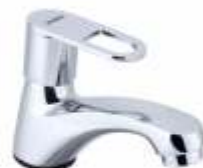
Pillar Cock Code : 1,585