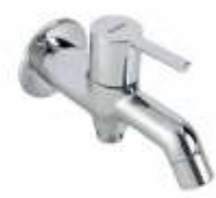
2 Way Bib Cock (CC) Code : 1,665