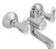
Wall Mixer Crutch Code : 5,105