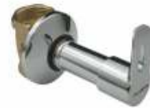
Concealed Flush Cock