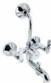
Wall Mixer Crutch Code : 5,215