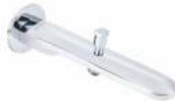
Bath Spout Tip Ton