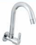
Sink Cock WM Code : 1,460