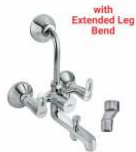
Wall Mixer 3 in 1 Code : 6,560