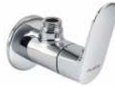
Angle Cock Code : 1,525