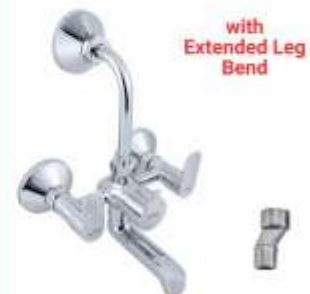
Wall Mixer OH (ELB) Code : 5,735