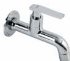
Bib Cock Code : 1,290