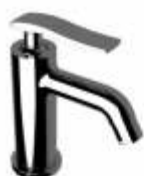
SL Basin Mixer