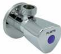
Forged Angle Cock (Triangle) with Plated Flange