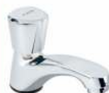
Pillar Cock Code : 1,630