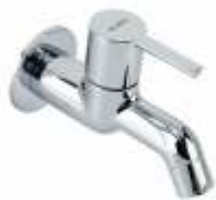
Bib Cock Code : 1,370