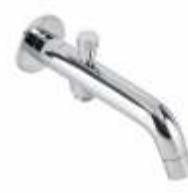
Bath Spout Tip Ton Code : 2,085