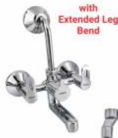
Wall Mixer OH (ELB) Code : 5,760