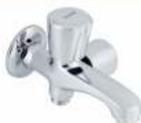
2 Way Bib Cock Code : 2,045