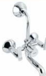
Wall Mixer OH Code : 5,785