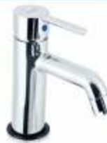
SL Basin Mixer Code : 3,795