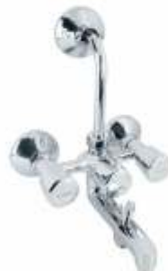
Wall Mixer 3in1 Code : 6,495