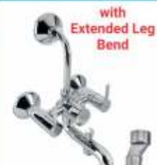
Wall Mixer 3 in 1 (ELB) Code : 6,860