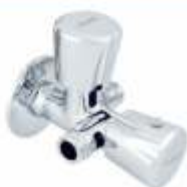
2 way Angle Cock Code : 1,730