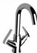
CH Basin Mixer