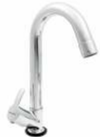
Swan Neck Code : 1,530