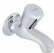
Bib Cock Code : 1,410