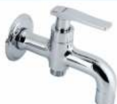
2 Way Bib Cock Code : 1,495