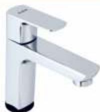
Pillar Cock Code : 3,000