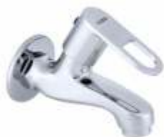
Bib Cock Code : 1,375