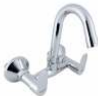
Sink Mixer Code : 3,455