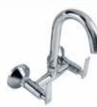
Sink Mixer WM Code : 4,210