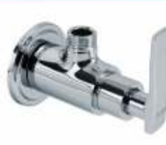
Angle Cock Code : 1,120