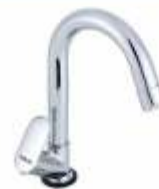
Swan Neck Code : 1,540