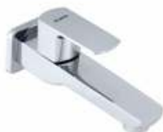
Bib Cock Long Code : 2,485