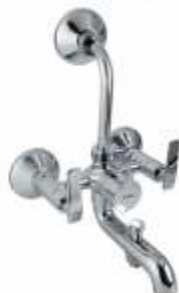
Wall Mixer 3in1 Code : 6,445