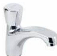
Pillar Cock Long Code : 2,580