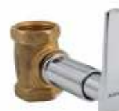
Concealed Stop Cock