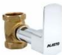
Concealed Stop Cock Size 15 mm Code 1,510