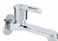
Bib Cock Long Code : 1,005