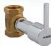
Concealed Stop Cock Size 15 mm Code 1,200