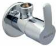
Angle Cock Code : 645