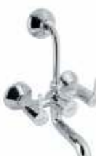
Wall Mixer OH Code : 6,230