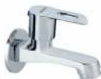
Bib Cock Code : 940