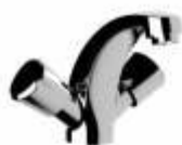
CH Basin Mixer