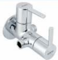
2way Angle Cock Code : 1,815