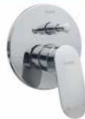
Diverter Upper Trim (46CHF28) Code : 1,500