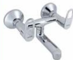
Wall Mixer NTS Code : 3,950