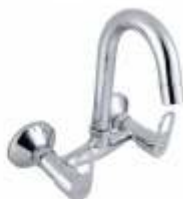
Sink Mixer WM Code : 4,120