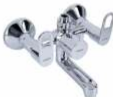
Wall Mixer Crutch Code : 5,145