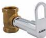
Concealed Stop Cock Size 15 mm Code 1,225