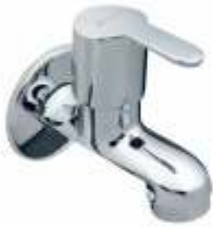
Bib Cock Code : 877