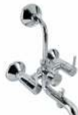
Wall Mixer 3 in 1 Code : 6,810