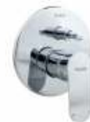
Diverter Upper Trim (46CHF28) Code : 1,245