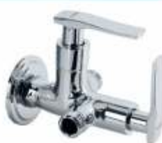
2way Angle Cock Code : 1,685