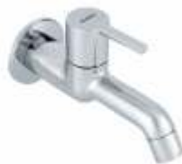
Bib Cock Long Code : 1,505