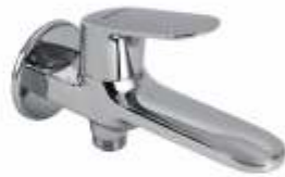
2 Way Bib Cock Code : 2,690