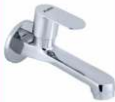
Bib Cock Long Code : 995