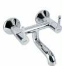
Wall Mixer NTS Code : 4,695