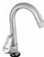
Swan Neck Code : 1,570