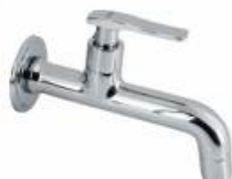
Bib Cock Long Code : 1,395