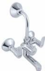
Wall Mixer OH Code : 5,685