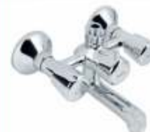
Wall Mixer with Crutch Code : 5,165