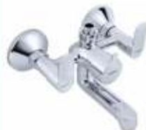
Wall Mixer Crutch Code : 5,070