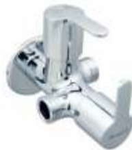
2 way angle Cock Code : 1,260