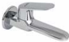
Bib Cock Code : 2,350