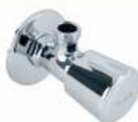
Angle Cock Code : 900