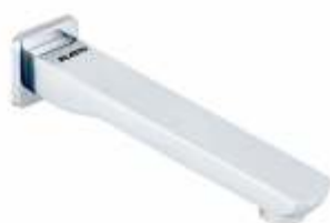
Bath Spout Code : 1,915