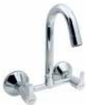
Sink Mixer High Flow (WM) Code : 2,805