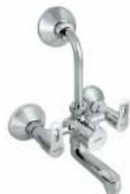
Wall Mixer OH Code : 5,710