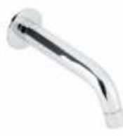
Bath Spout Code : 1,230