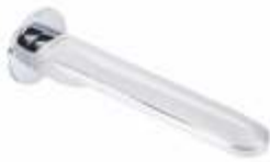
Bath Spout Code : 1,720