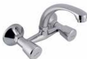
Sink Mixer WM Code : 4,230