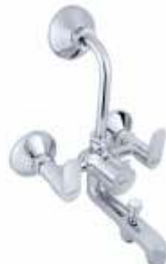
Wall Mixer 3 in 1 Code : 6,490