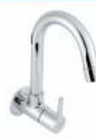
Sink Cock WM Code : 2,000