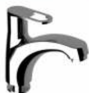
Pillar Cock Long Code : 2,530