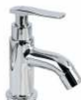
Pillar Cock Code : 1,650