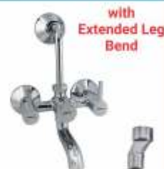
Wall Mixer OH (ELB) Code : 6,280