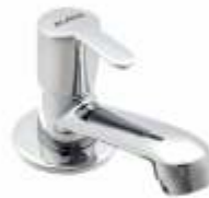
Pillar Cock Code : 1,075