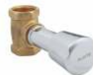
Concealed Stop Cock Size 15 mm Code 1,300