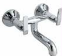
Wall Mixer NTS Code : 4,110