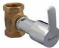
Concealed Stop Cock Size 15 mm Code 1,050