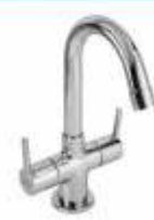
CH Basin Mixer Code : 3,500