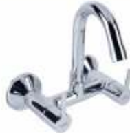
Sink Mixer WM Code : 4,315