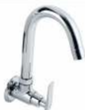
Sink Cock WM Code : 2,565