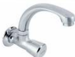
Sink Cock WM Code : 2,570