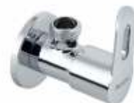
Angle Cock Code : 660