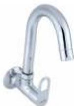
Sink Cock WM Code : 2,600