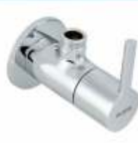
Angle Cock Code : 1,070