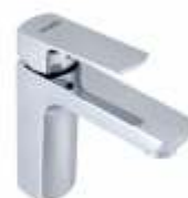
SL Basin Mixer Code : 5,075