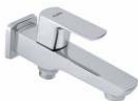
2Way Bib Cock Code : 2,855