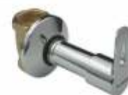
Concealed Stop Cock Size 15 mm Code 1,065