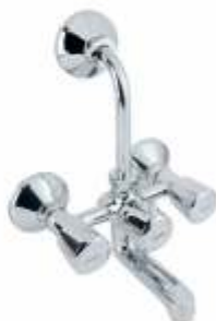
Wall Mixer OH Code : 5,725