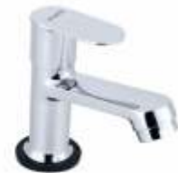
Pillar Cock Code : 1,035