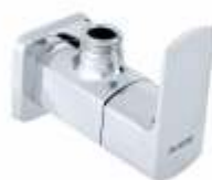
Angle Cock Code : 1,575