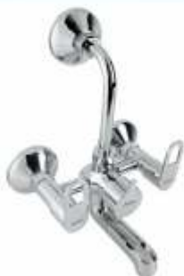
Wall Mixer OH Code : 5,745