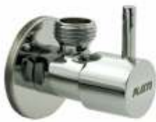
Forged Angle Cock (Flora) with Plate