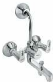
Wall Mixer 3 in 1 Code : 6,505