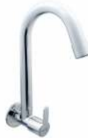
Sink Cock Code : 1,425