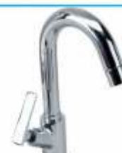
Swan Neck Code : 2,725