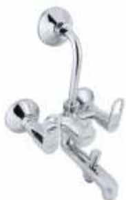
Wall Mixer 3 in 1 Code : 6,555