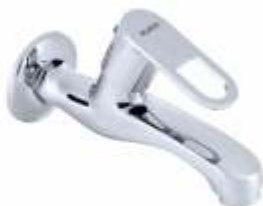
Bib Cock Long Code : 1,520