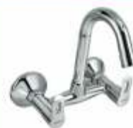
Sink Mixer WM Code : 3,475