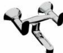
Wall Mixer NTS Code : 4,245