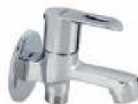
2Way Bib Cock Code : 1,145