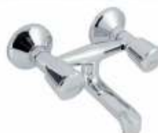
Wall Mixer NTS Code : 4,575