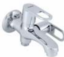
2Way Bib Cock Code : 1,995